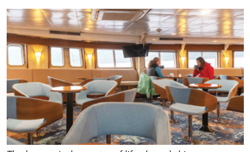
The lounge is the center of life aboard ship.

The ship features a library; global market; lounge with full-service bar and facilities for films, slide shows, and presentations; observation deck; partially covered sundeck with chairs and tables; and LEXspa. An open Bridge provides guests an opportunity to meet the officers and captain and learn about navigation.