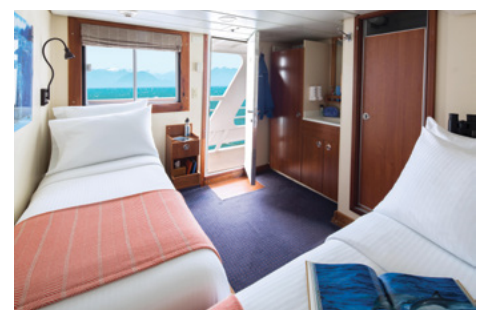
Category 2 cabin with single beds.

All cabins face outside with windows, private facilities, and climate controls. Cabins are equipped with Wi-Fi and multiple electrical and USB outlets. Botanically inspired shampoo, conditioner, shower gel, and lotion are all